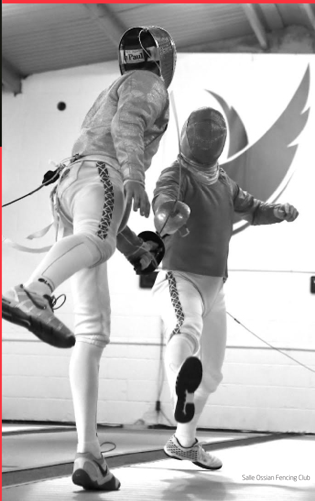
Salle Ossian Fencing Club

Winners in Live Active Leisure’s Spirit of Sport Awards were announced via an online ceremony on Thursday 22nd April 2021. Recognising the efforts made and achievements gained by sports clubs, groups, organisations, athletes, volunteers, and coaches during lockdown 2020, the awards saw five worthy local winners pick up accolades.